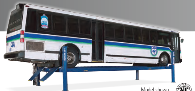
Model shown: SM30N010RD