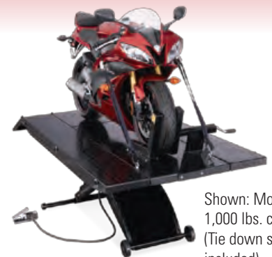
Shown: Model RXLDT 1,000 lbs. capacity (Tie down straps not included)