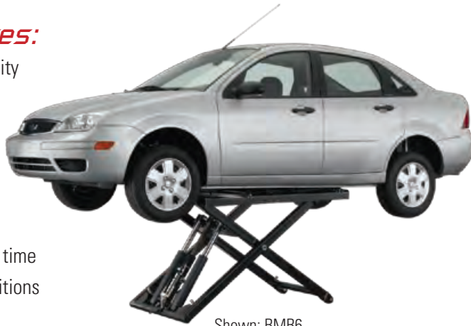
Shown: RMR6 6,000 lbs. capacity