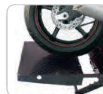
Shown: Model RXLDT with ATV adapters 1,000 lbs. capacity